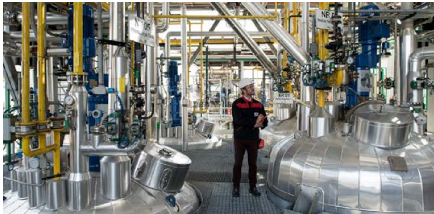
At its Latina site in Italy LANXESS produces, among others, the lubricant additive Naugalube.

The KPIs and SPTs set out in this framework will remain applicable throughout the tenor of any Sustainability-Linked Financing Instruments issued under the Framework, regardless of any changes to LANXESS' sustainability strategy or changes and future updates of the Framework.