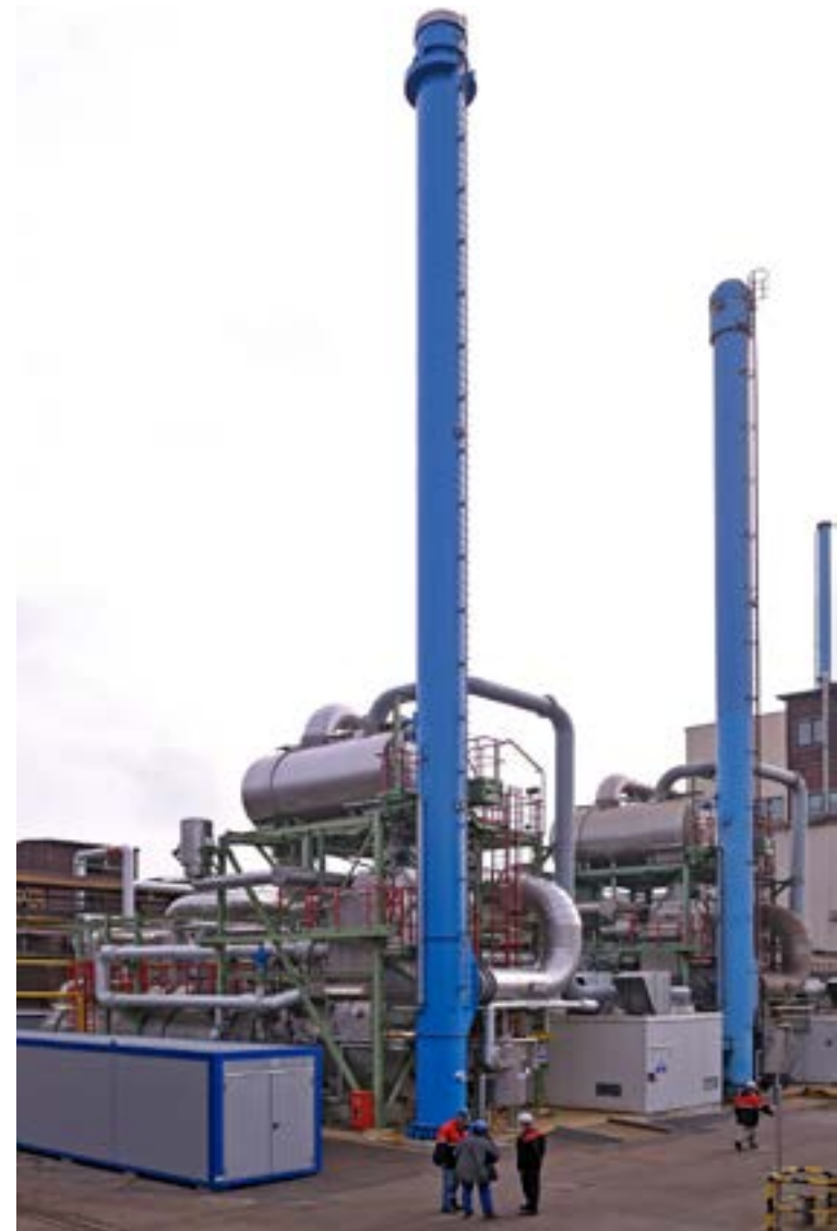
With its second nitrous oxide reduction plant at the Krefeld-Uerdingen site, LANXESS is the only manufacturer of adipic acid that can almost completely neutralize the climate gas emitted during production.