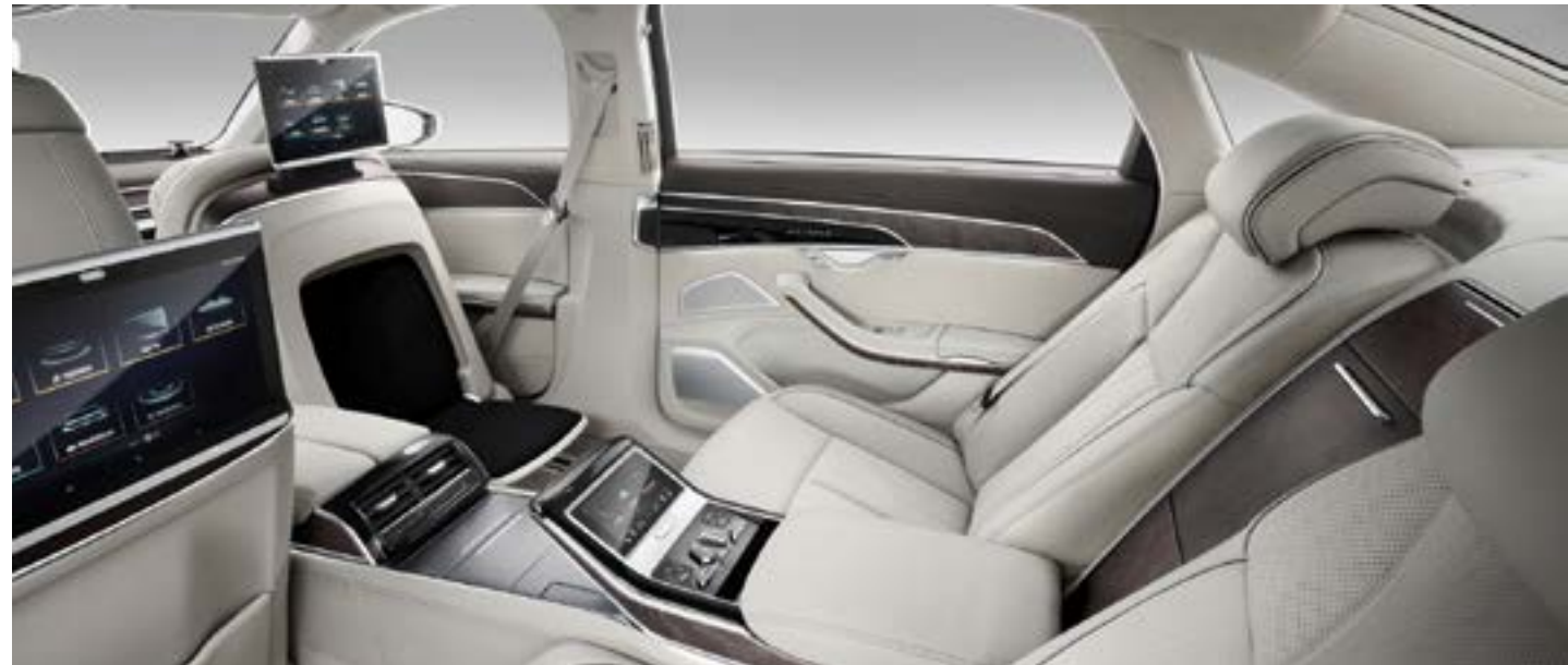
High-performance polymers and battery chemicals from LANXESS promote the global transformation to climate-friendly mobility.

In general, potential changes to any of the principles governing this Framework will either keep or improve the current level of disclosure.