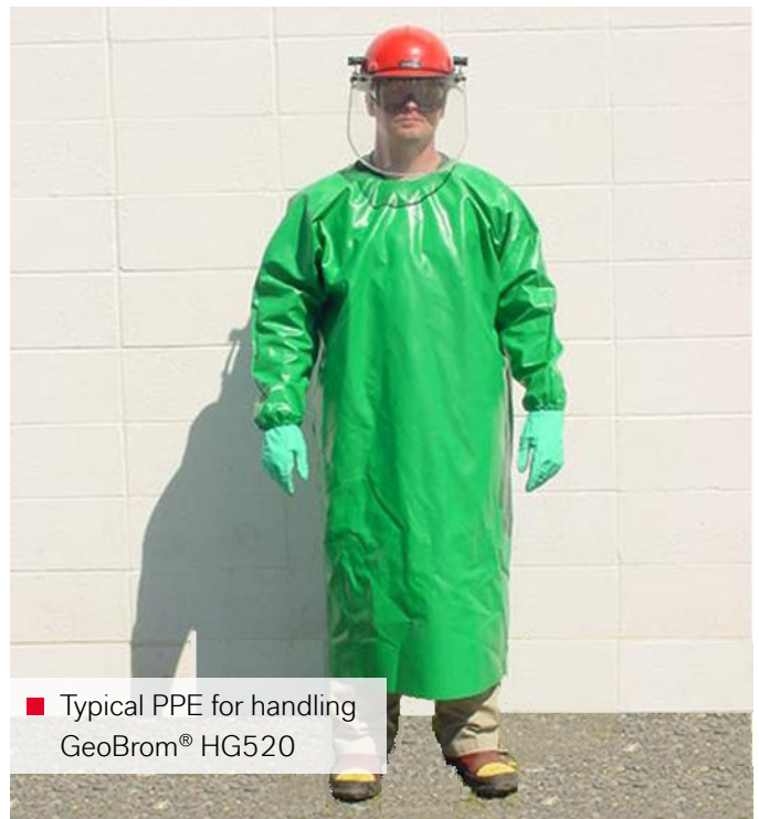
■ Typical PPE for handling GeoBrom® HG520

Visit our website to obtain a copy of the product data sheet.